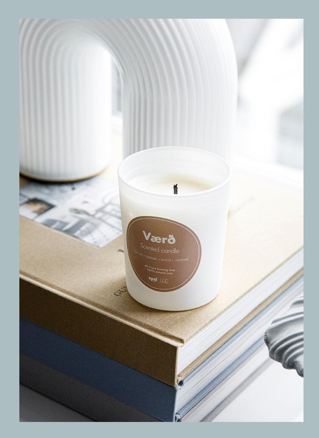
URĐ x Epal

provide white-label options, and undertake private projects for companies.