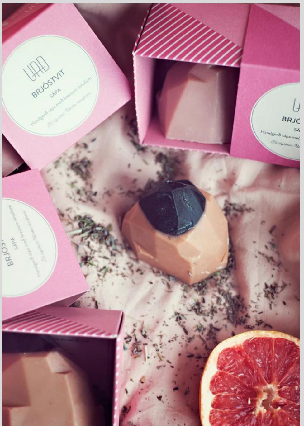
URĐ x Neistinn